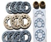
Spare Parts of Hydraulic Motor & Pump