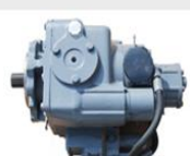
Variable Displacement Pump