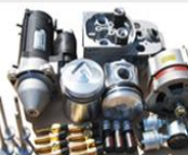
Engine Spare Parts