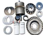
Transmission & Torque Converter Spare Parts