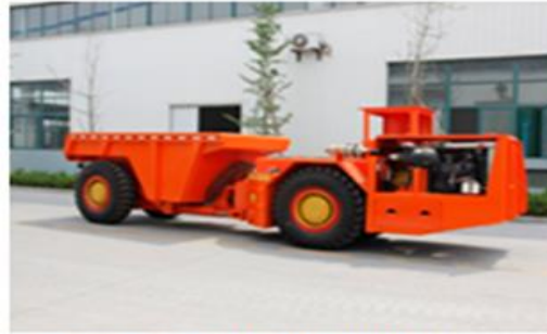
Dump Truck XYUK-8/10/12/15 ton