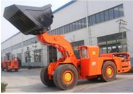
Diesel Loader XYWJ-3B (Big Arm) Tramming Capacity: 6000Kg