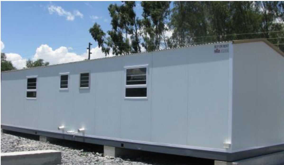
Bjmnyanda P School

Dilopye Prevocational School Dominican School for the Def Norkem Park High School N'wanati High School Bjmnyanda P School