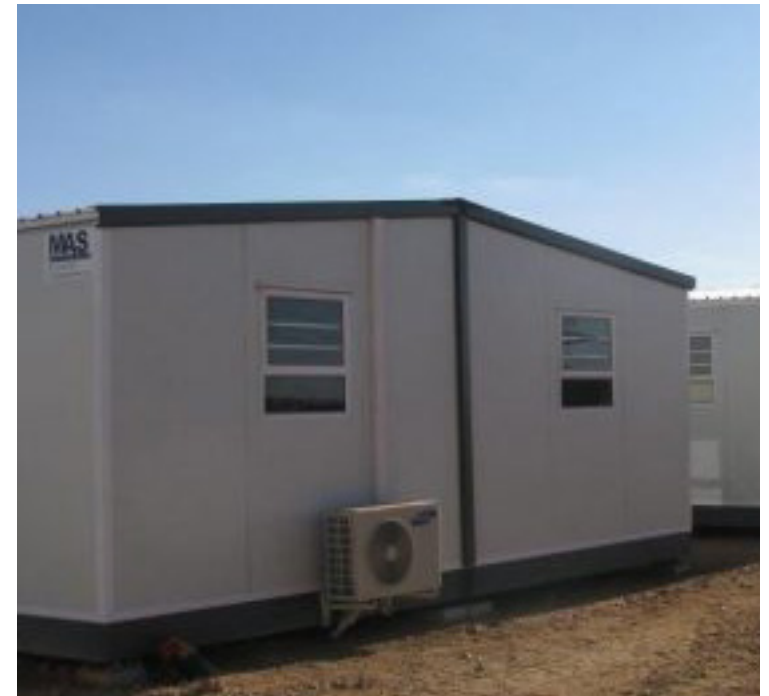
N'wanati High School